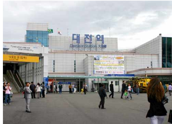
Daejeon Station (KTX)