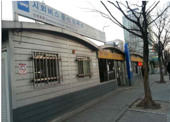
Government Complex Bus Station